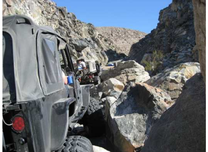
Sledge Hammer, Johnson Valley